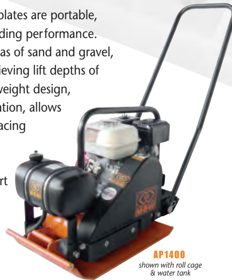
AP1400 shown with roll cage & water tank

The 1400 Series of vibratory plates are portable, economical and offer outstanding performance. Ideally suited for confined areas of sand and gravel, the GP1400 is capable of achieving lift depths of 10 inches (25 cm). The lightweight design, accompanied by intense vibration, allows the GP1400 to be used for placing interlocking paving stones. The removable handle allows for convenient transport in any vehicle. Roll cage and water tank standard equipment on AP1400 for asphalt applications.